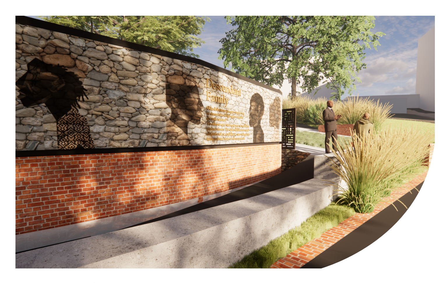
Variation 2. Courtesy of Baskervill