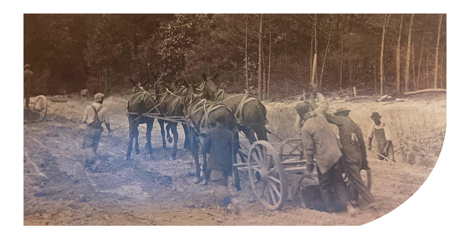
Charles F. Gillette, Road Grading on the Richmond College campus, 1912–13, Courtesy of Virginia Baptist Historical Society