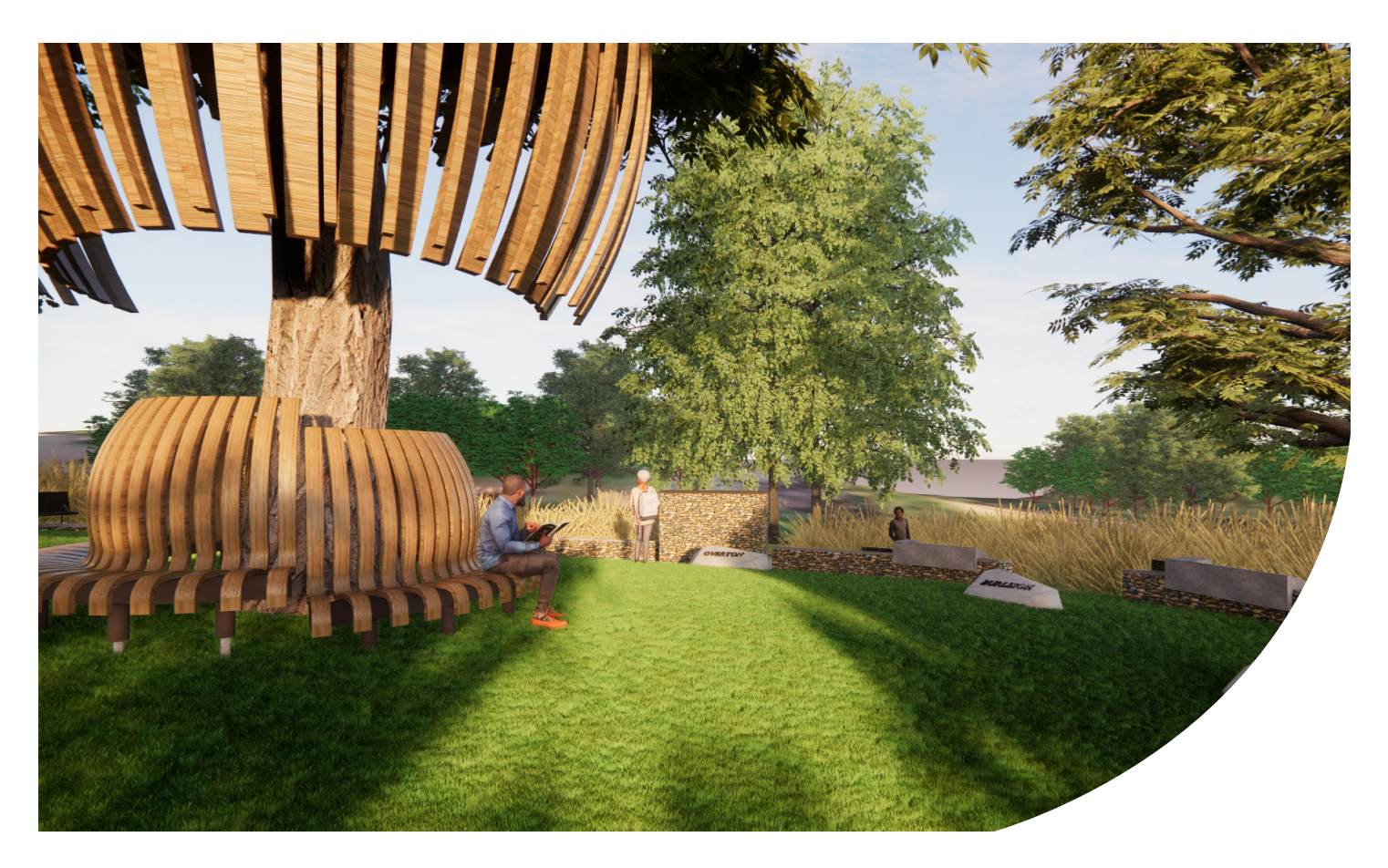
Variation 3.