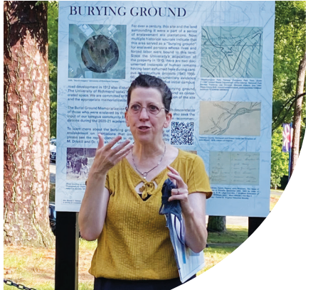
Descendants gather at the Burying Ground