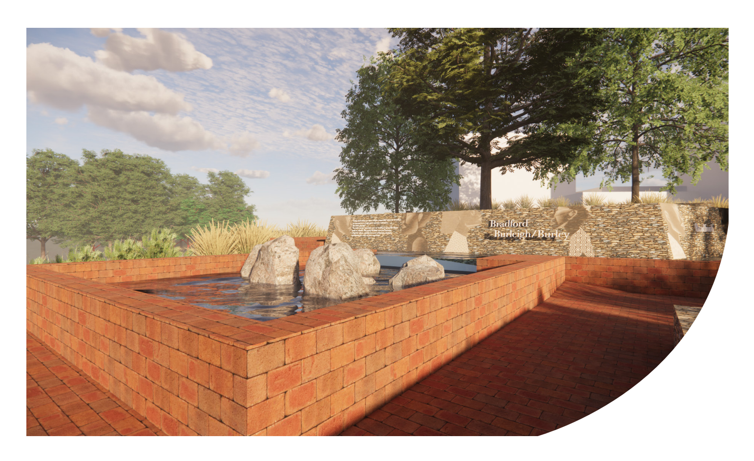
Variation 1

should be amenable to grow with the memorial as new information is unearthed. The memorial intervention should have a lighter touch while engaging the hillside, meaning minimal footings, drainage, and utility work on site.